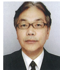
Academy for Global Leadership Office Head