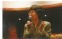
Question and feedback from audience to panelist