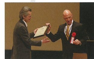
Certificate of Leadership Fellow from the Georgia Institute of Technology