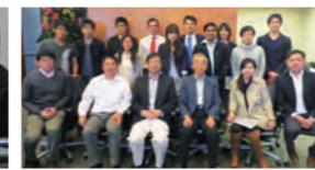
Training session on crowd funding