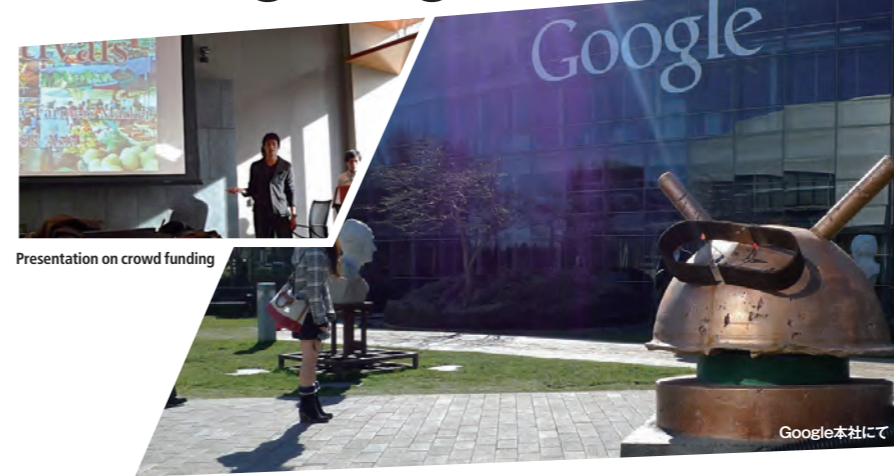
Presentation on crowd funding