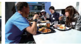
Lunch meeting at Google's headquarters