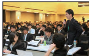
The actions of Tokyo Institute of Technology students, especially who belong to AGL, were remarkable in the group work.

In the group work conducted on the second day, students tackled the challenge of providing solutions to problems by forming groups of those with backgrounds in different disciplines of specialization. The students experienced their “first jobs” of, even as being engaged in heated discussions, cooperating together by multi-disciplinary creative collaboration to put together conclusions, and presenting the results in the student forum.